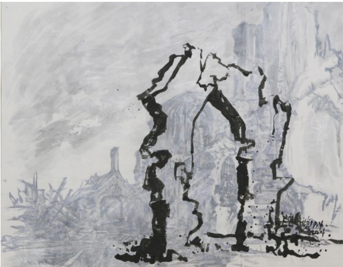
Yang Jiechang 楊詰蒼, Arc de Triomphe 1914-2014, 2014, ink and acrylic on paper, mounted on canvas, 152 x 191cm