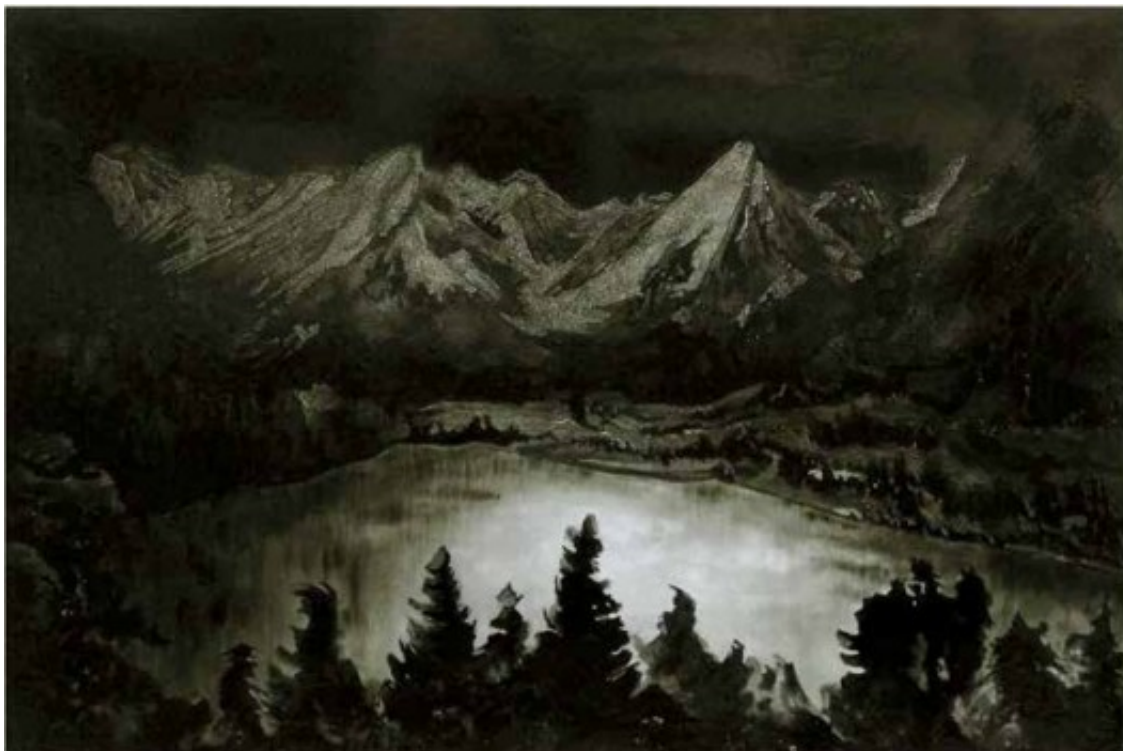
《湖光1913-2013》，蛋壳漆画，125×180 cm，2013 Yang Jiechang, Light under Water (These are