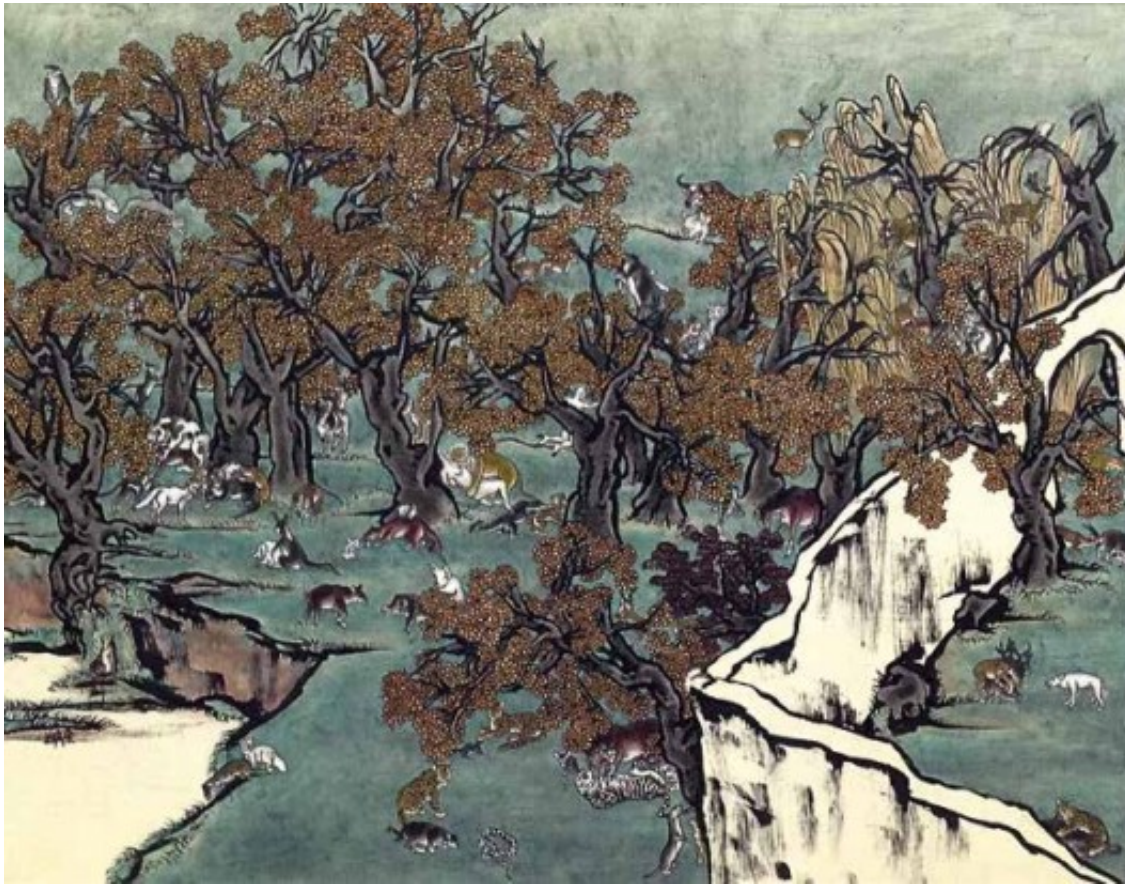
《芥子园1》，绢本工笔重彩，110×150 cm，2011 Yang Jiechang, Mustard Seed Garden 1, 2011, ink and mineral colors on silk, mounted on canvas, 110 x 150 cm.

quality in what concerns these acts recorded as video. Another example: On 9/11 I watched news like everyone, but after having watched the same images over and over again, I realized that there was something wrong. I was furious about what appears to me as a huge lie. The only image that seemed authentic was that of a man covered with dust, running away from the crumbling towers and shouting “Oh, my god”. The best way to express my position seemed to write down this sentence. Thus I did calligraphy and corresponding videos that show me writing and pronouncing “Oh, my god” and later I translated the expression in my mother language Cantonese. The use of the Cantonese expression “Diu”, which actually means “Fuck” makes this work more concrete. I showed it also in Moscow, where I added the Russian equivalent.