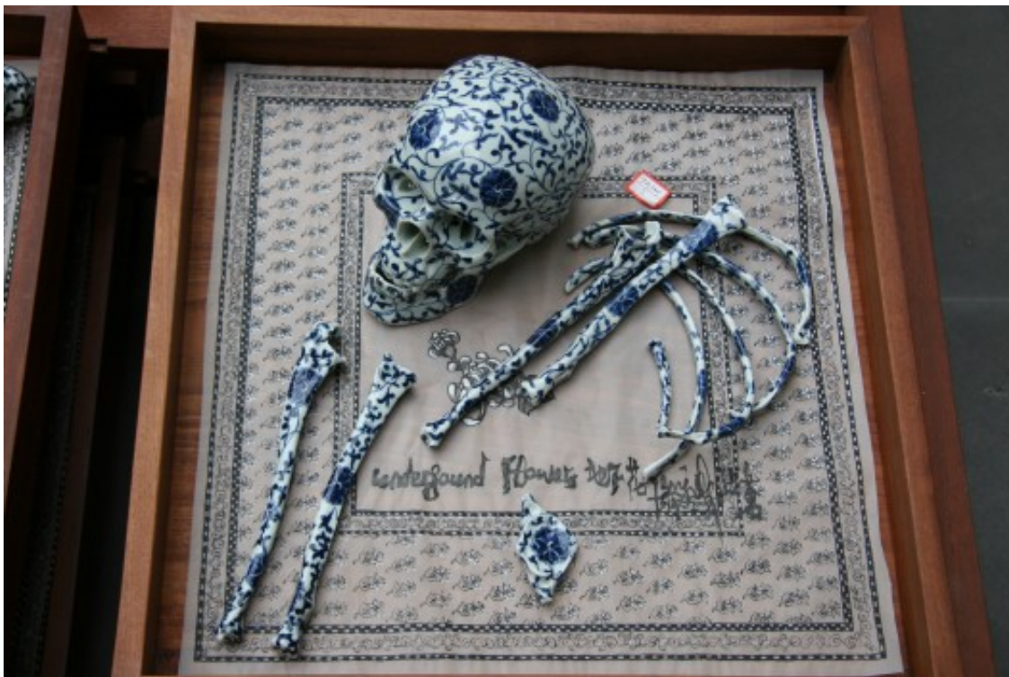
Yang Jiechang 楊詰蒼, Underground Flowers – Self- portrait, 2004, blue-white porcelain, wooden box, silk print