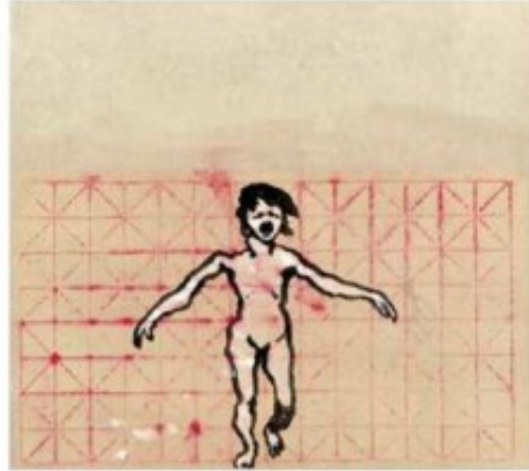
《跑吧1》，水墨，习字纸，61.5×68.5 cm，2014（左）；《跑吧2》，2014年，水墨，习字纸，61.5×68.5 cm，2014（右） Yang Jiechang, Running Children 1, 2014, ink on paper, mounted on canvas, 61.5×68.5 cm( left); Running Children 2, 2014, ink on paper, mounted on canvas, 61.5×68.5 (right)

HNJ: You not only copied paintings by Hitler but also paintings by the Song dynasty emperor Huizong.