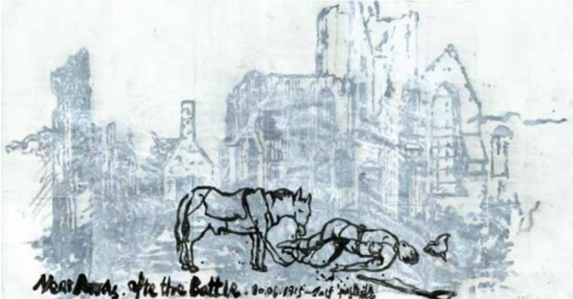
《战后1915-2015》，墨、丙烯、宣纸，120×232 cm，2015. Yang Jiechang, After the Battle 1915 – 2015, 2015, ink and acrylic on paper, mounted on canvas, 120×232 cm. Yang Jiechang, Running Children 1, 2014, ink on paper, mounted on canvas, 61.5×68.5 cm( left); Running Children 2, 2014, ink on paper, mounted on canvas, 61.5×68.5 (right)