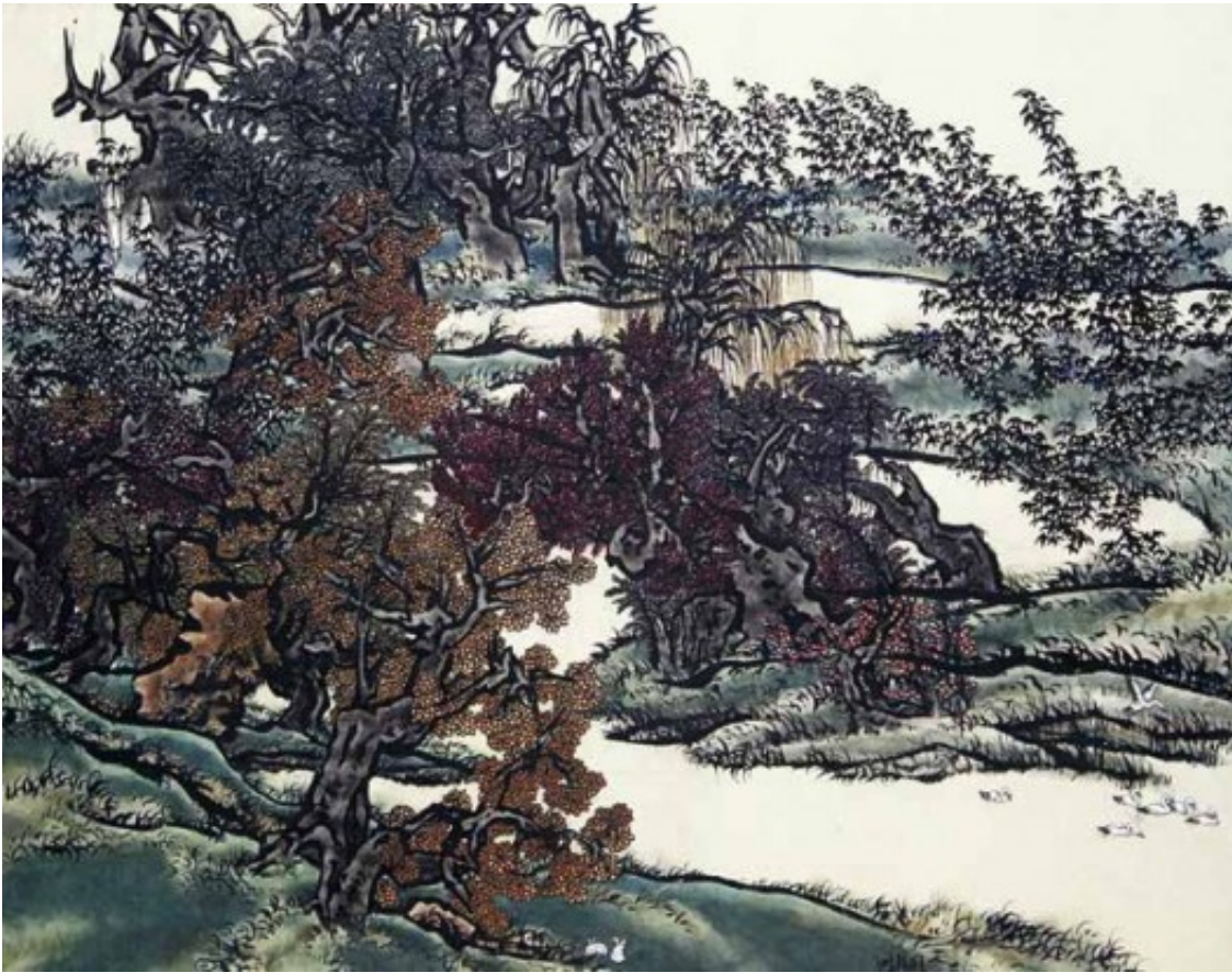
《芥子园3》，绢本工笔重彩，110×150 cm，2011 Yang Jiechang, Mustard Seed Garden 3, 2011, ink and mineral colors on silk, mounted on canvas, 110 x 150 cm.

HNJ: Let us come back to the question of how the chosen medium influences content or expression. What changes from one medium to the other and how would you describe the development or history of your self-portraits?