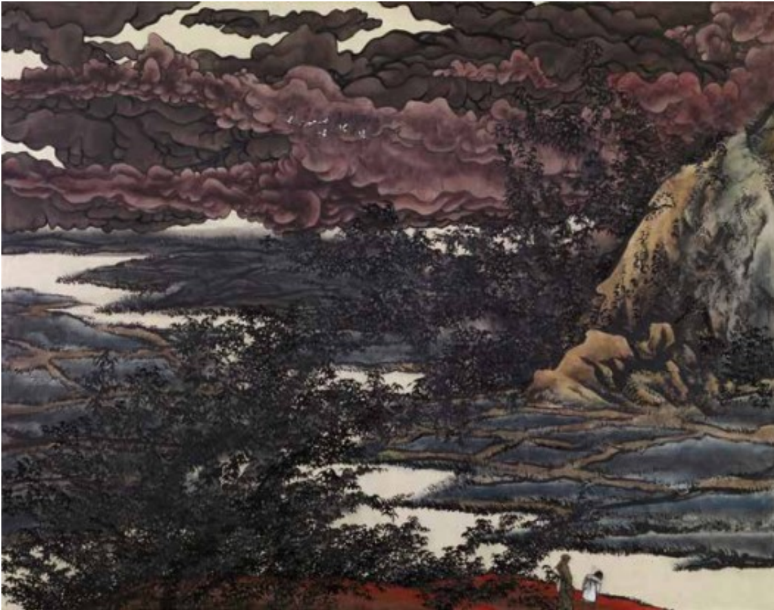
《芥子园2》，绢本工笔重彩，110×150 cm，2011 Yang Jiechang, Mustard Seed Garden 2, 2011, ink and mineral colors on silk, mounted on canvas, 110 x 150 cm.